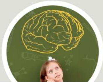
NEURODEVELOPMENTAL DISORDERS PROGRAM