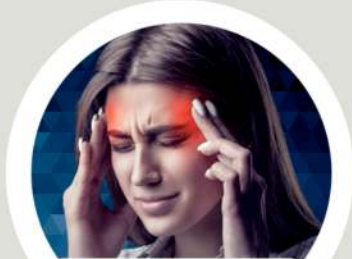
MASTERING MIGRAINE PROGRAM