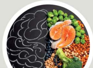
NEUROCHEMISTRY & NUTRITION