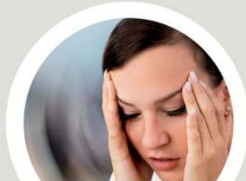
VESTIBULAR REHABILITATION PROGRAM